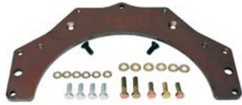
sample transmission adapter plate